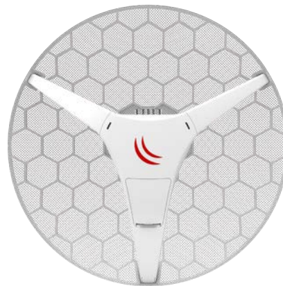
LHG HP5 / LHG 5 ac